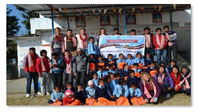
White canes, Wheel chair, School Supplies and furniture were distributed at the Welcome program

organized for the visiting ICYEP Team by Ekata Youth Club, Rotaract Club of Parbat, Rotaract club of New road Pokhara, Rotary Club of Parbat and Rotary Club of Pokhara New road where 17 visually disabled students from Shree Shivalaya Higher Secondary School received White canes and Furniture, 1 Physically disabled student from Narayan Higher Secondary School received a wheelchair and 50 Students from Balmadir Primary School received school bags with supplies.